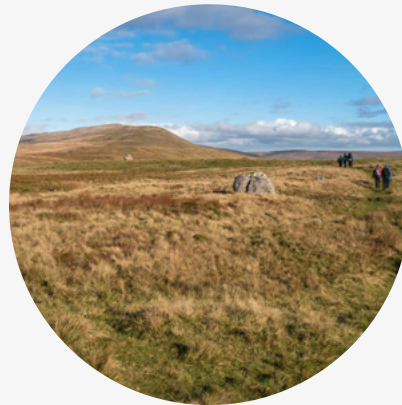
Whernside - 736m